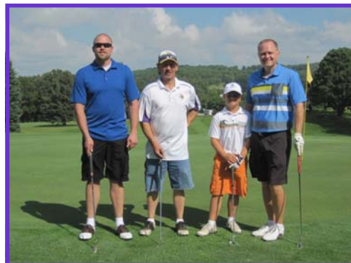
A few of our 2013 Golf Outing participants.