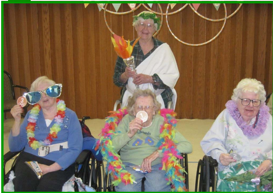
CVCC Olympic Team Captains and Lady Liberty

CHOSEN VALLEY CARE CENTER, INC. A Senior Living Community